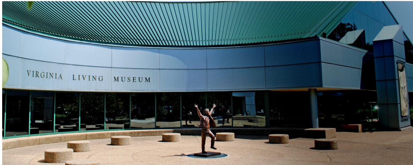
The Main Building