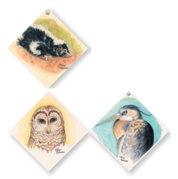
Watercolor images